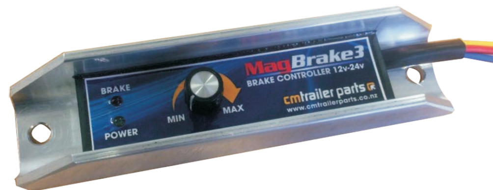
Part No: TE5ETM

Designed for use on Trailers up to a Maximum Capacity of 2500kg gross laden weight